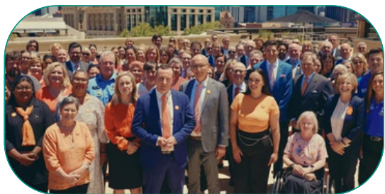
16 Days in WA - 2021

Impact: The 16 Days of Activism against Gender-Based Violence is an annual international campaign that kicks off on 25 November, the International Day for the Elimination of Violence against Women, and runs until 10 December, Human Rights Day. It was started by activists at the inaugural Women's Global Leadership Institute in 1991 and continues to be coordinated each year by the Center for Women's Global Leadership. It is used as an organizing strategy by individuals and organizations around the world to call for the prevention and elimination of violence against women and girls.