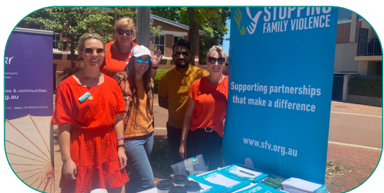
Midland March the Matters