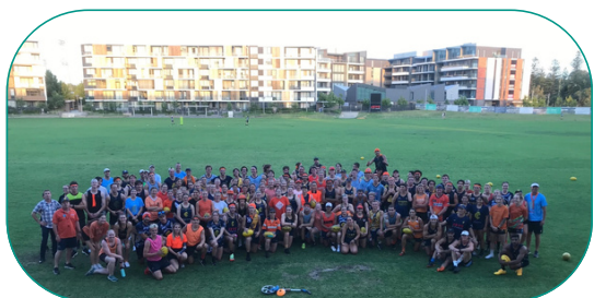
Claremont FC - 16 Days in WA